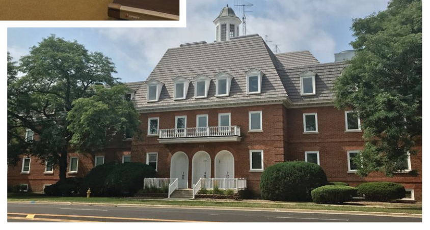
Park Ridge Doctors' Office

Over the years, IBJI has grown to over 150 physicians and more than 50 locations throughout Illinois. In this growth, we continue to stand by and uphold our Core Values of Patient-Centric Care, Musculoskeletal Care, and Teamwork. Our IBJI family is growing and adapting so that we can continue to provide exceptional orthopedic care to treat the needs of our patients' families.