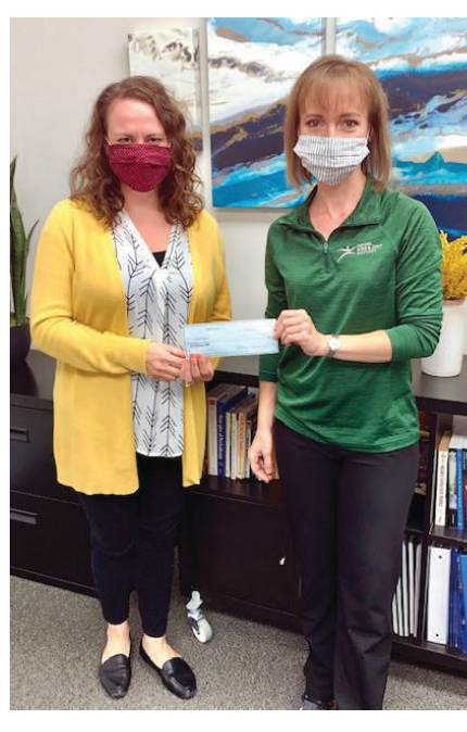
Glenkirk used IBJI CARES donation to purchase mobile devices which allows their adult residents with special needs to receive telehealth services and engage in virtual social activities during this pandemic and beyond.