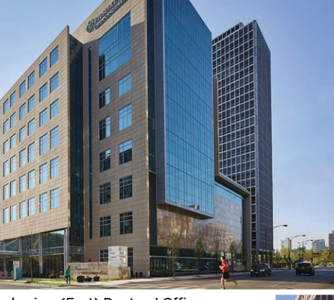
Lakeview (East) Doctors' Office