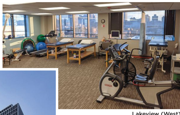
Lakeview (West) Physical Therapy Office