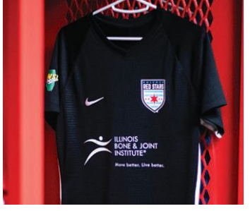
Pictures provided by the Chicago Red Stars during the 2020 NWSL Challenge Cup.